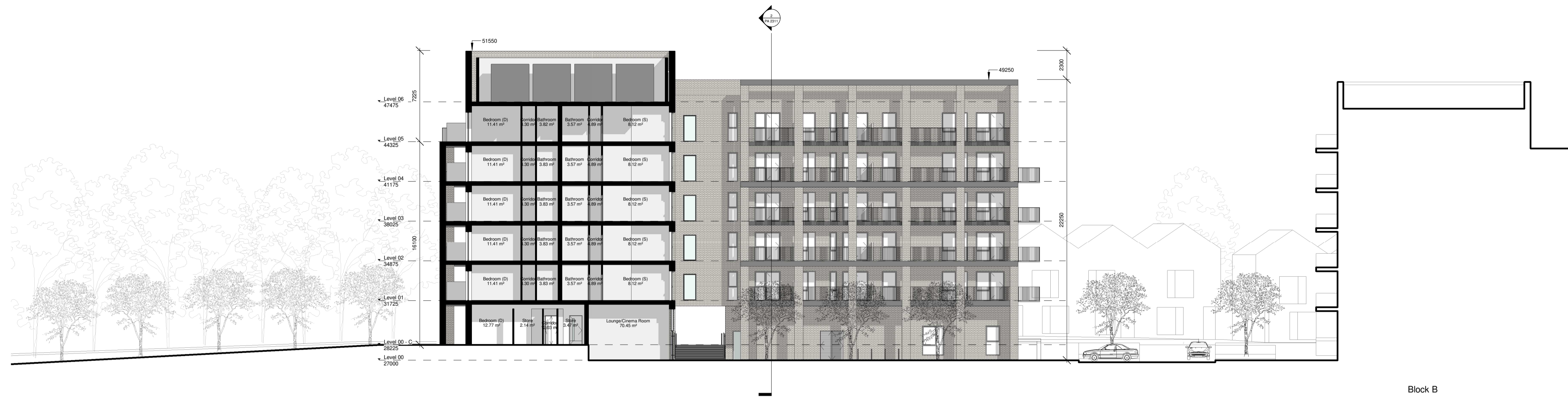
1 Block A - North Section