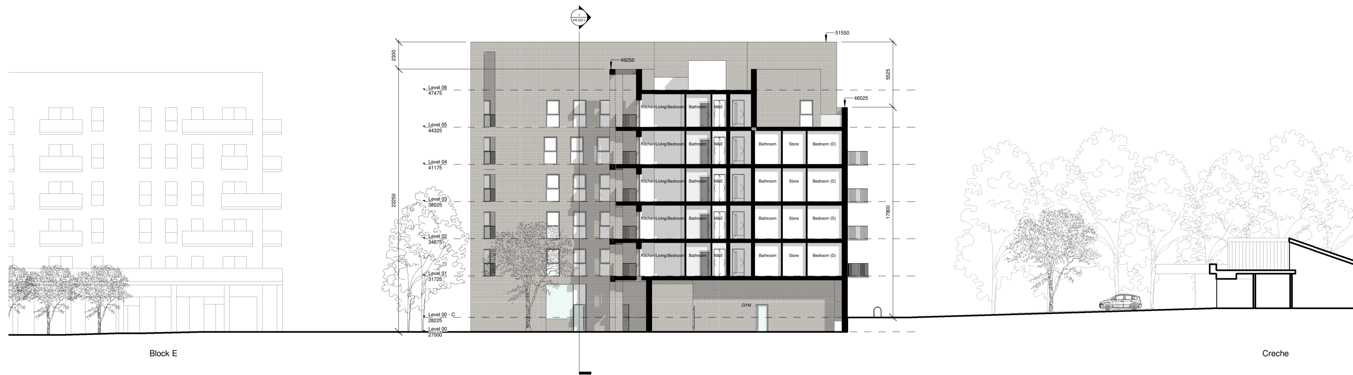
2 Block A - East Section